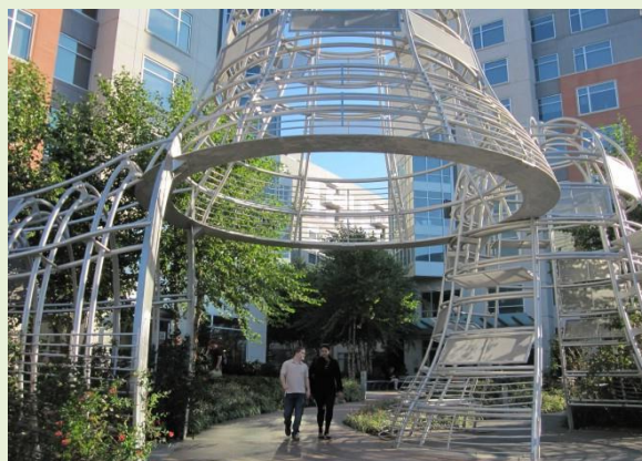
Wave Forms by Dennis Oppenheim Housing complex, 34 th & Chestnut, Pennsylvania, PA