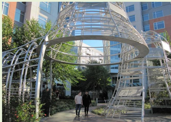
Wave Forms by Dennis Oppenheim Housing complex, 34 th & Chestnut, Pennsylvania, PA