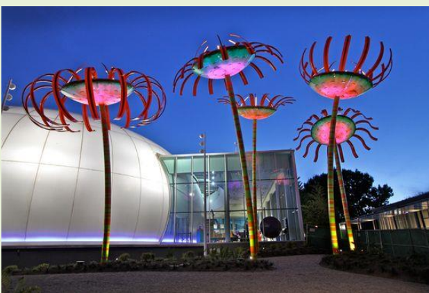
Sonic Bloom by Dan Corson Seattle Center, Seattle, WA