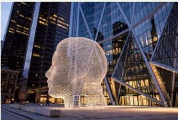
Wonderland by Jaume Plensa EnCana Corporation, Calgary, Canada