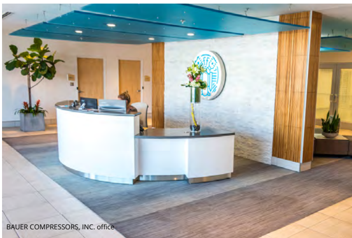
BAUER COMPRESSORS, INC. office